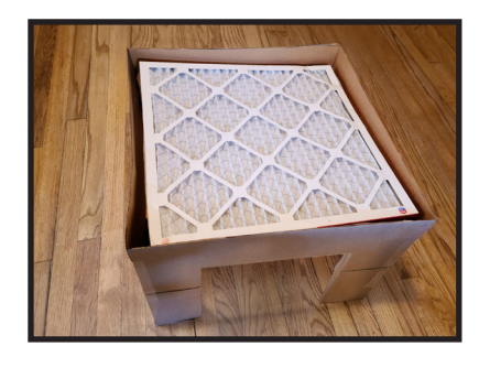
STEP 8: Place your 4x20x20 MERV 13 filter in the frame face down