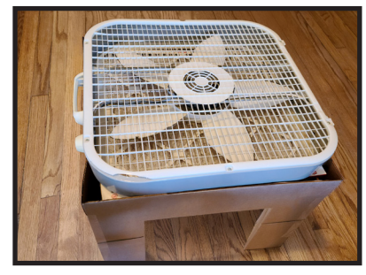
STEP 9: Place your 20-inch box fan on top of the filter face down so that it blows down through the filter