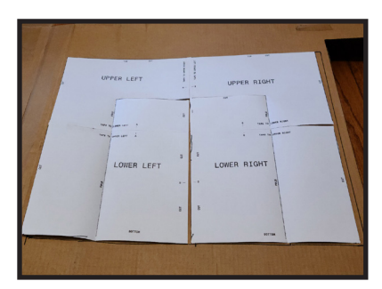
STEP 3: Use the template to mark up one side of the frame on cardboard