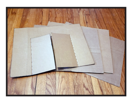
STEP 5: Cut out three more copies of the cardboard sides to make four total

STEP 10: Place the completed fan as close to the center of the room as practical and run the fan on high for maximum filtration