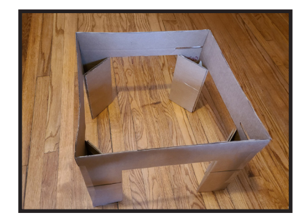
STEP 7: Fold the leg flaps over each other and tape them together. The frame is now complete