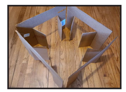
STEP 6: Stand the sides up and tape the corners together