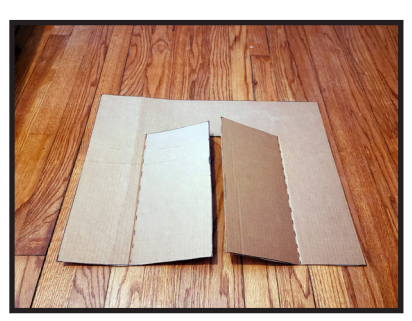
STEP 4: Cut out cardboard frame side and fold along indicated lines