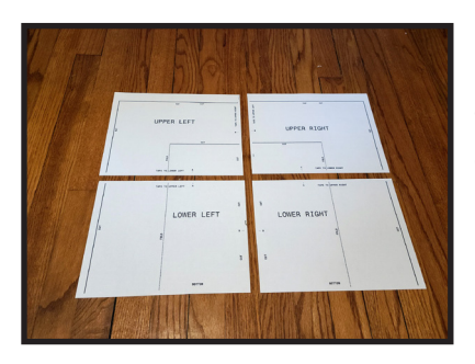
STEP 1: Print the four PDF files at full scale. Then tape the four pages together as indicated on the templates