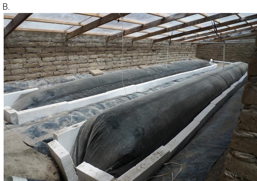
Figure 3 A. Implementation of rigid tank design in a high elevation location (Las Rocas Refuge 5130 masl). B. Tubular digester design including an insulated trench and greenhouse.