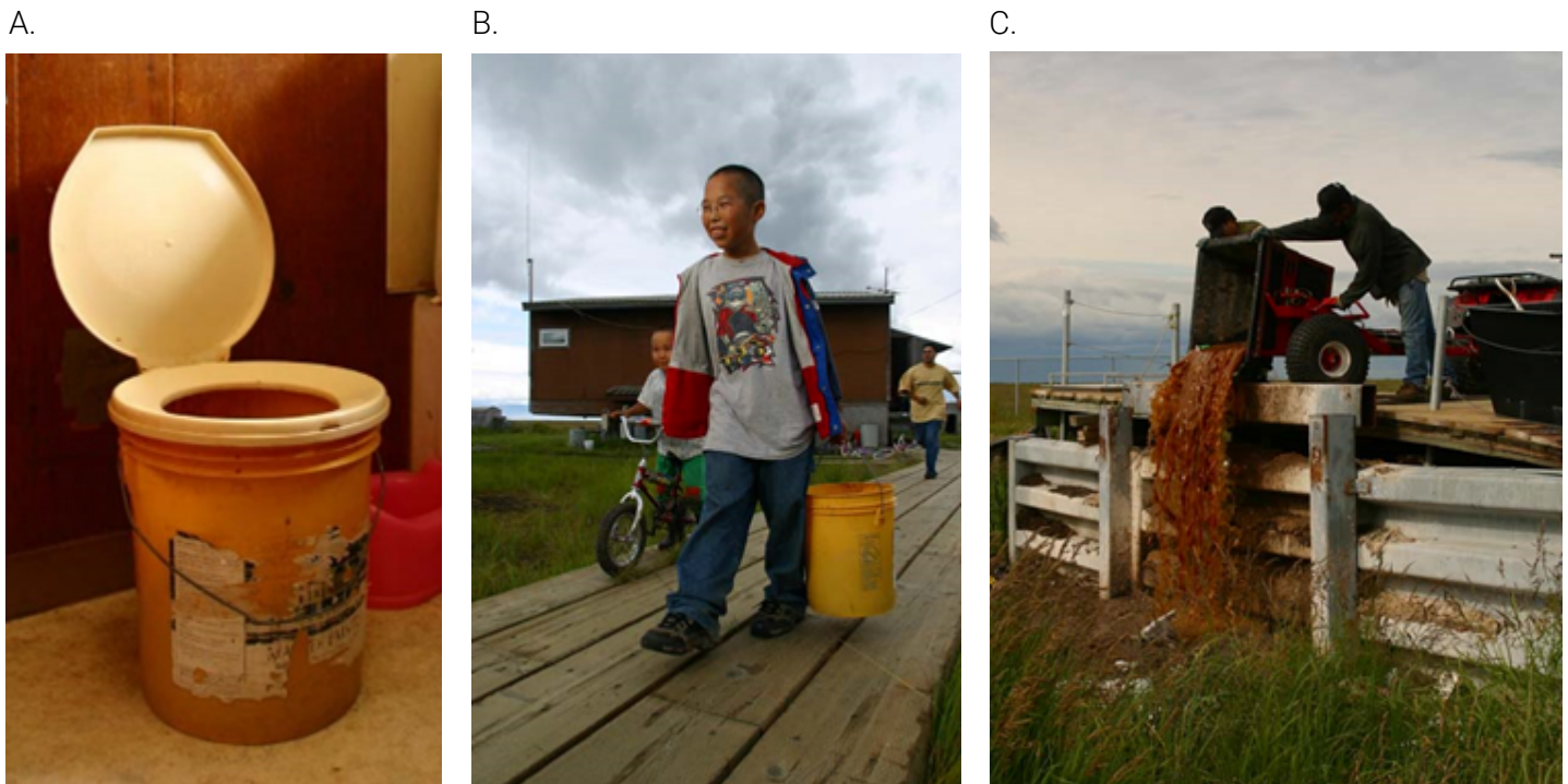
Figure 1. Current sanitation system for the tribal village of Atmautluak, located in western Alaska. Fig 1a - honey buckets used to collect human urine and feces in a home. Fig 1b – a young native hauling honey bucket waste to the hopper. Fig 1c – a hopper disposing of human waste into a sewage lagoon.

Currently, over 3,000 Alaskan households use unlined sanitation systems, like “honey buckets,” to collect human waste. The honey buckets are often lined with plastic bags and require residents to haul their waste to collection hoppers or directly to sewage lagoons (Figure 1). This current honey bucket and hauling system poses numerous sanitation, public health, social, and environmental concerns including spillage, exposure to raw sewage, and a burden to those physically incapable of moving their waste. Temperatures vary across Alaska with average lows in the -30s and highs around 15°C. 1 Diesel is used as the primary fuel for heating homes; nearly 80% of Alaskan rural households rely on diesel to meet their energy needs with the poorest households spending half of their annual income on heating fuel and electricity. 2 This reliance on diesel results in indoor air pollution, high rates of child asthma, and high fuel costs. When it comes to the Sustainable Development Goals, rural and off-grid communities are often left behind in both water, sanitation, and hygiene services and energy. 3