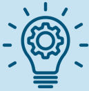
DESIGN FOR GOOD

To learn more about the Impact Projects worked on in 2021 by the E4C Fellows '21, visit: https://www.engineeringforchange.org/research-report/2021-annual-report